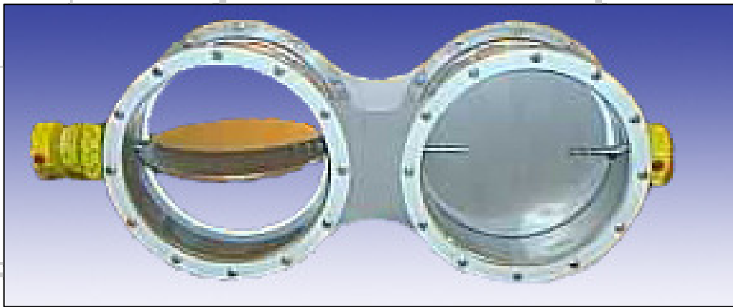
Photograph shows the KDHC Twin

Konvekta has the capability to manufacture customized products: