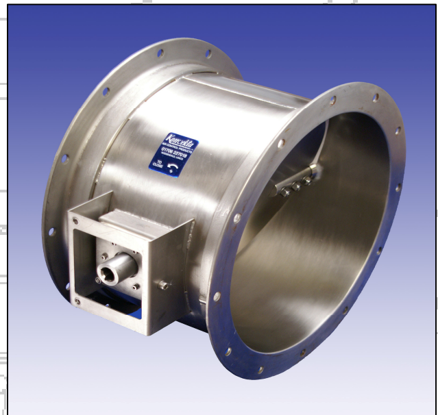
Type KHDC 2

Konvekta Ltd has the technology and expertise to produce products that continually excel on design and application quality