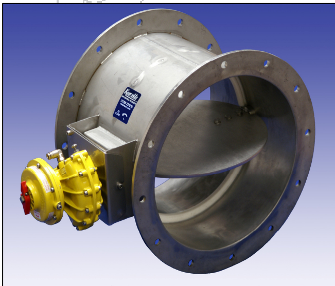
Type KHDC 1

Konvekta Ltd have designed and manufactured a wide range of ventilation products to fulfil all air control requirements. The Konvekta products can be adapted to suit many different applications or tailored to meet specific requirements, providing complete air control solutions